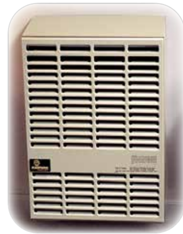
Direct Vent Wall Furnace

Vent Kit includes: inside and outside mounting plate, 14" long vent pipe and vent cap