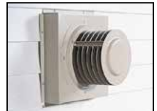
DV-822 Vinyl Siding Vent Kit

Heat larger areas with Empire's DV-25 and DV-35 Direct-Vent wall furnaces. Delivering room-filling warmth, each furnace is stylishly crafted and fits against an outside wall.