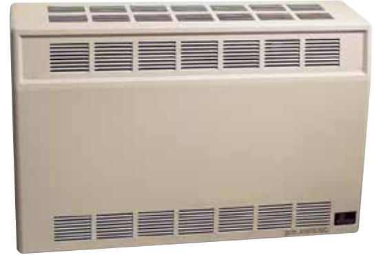
Direct Vent Wall Furnace