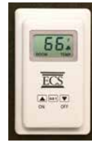
TRW Wireless Remote Wall Thermostat