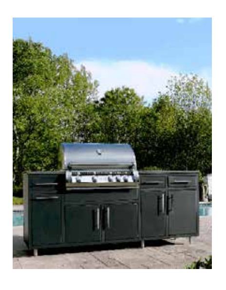
CABINET COLOR OPTIONS