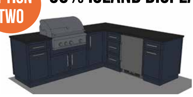
Display credit for appliances varies by brand.