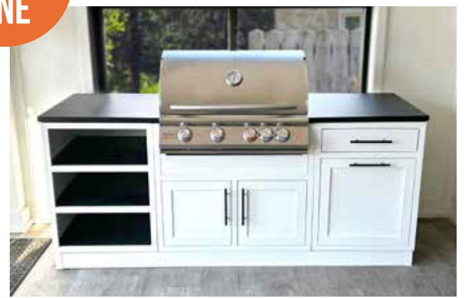
Display credit for appliances varies by brand.