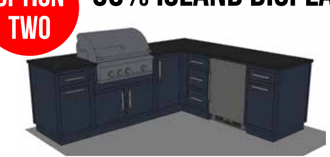
Display credit for appliances varies by brand.